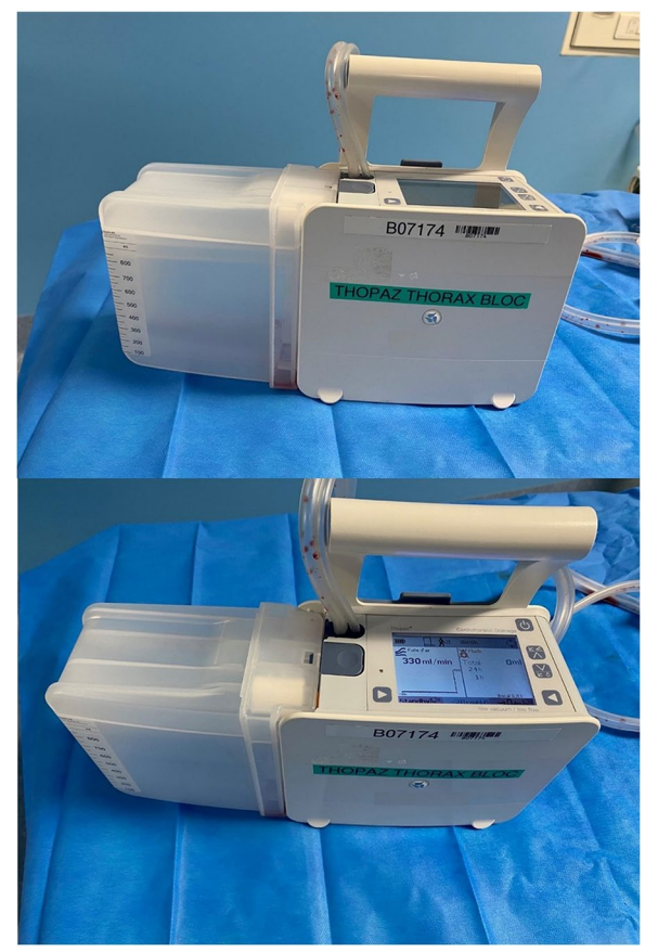
Fig. 3 Example of a digital drainage system

A surgical management is therefore proposed: